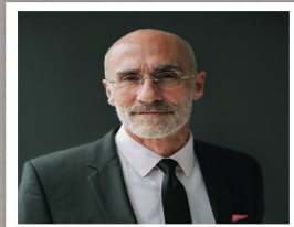
Arthur C. Brooks Harvard Professor; Bestselling Author