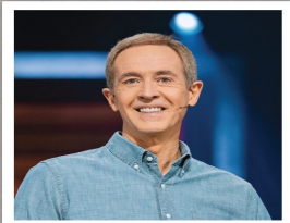
Andy Stanley Founder, North Point Ministries; Bestselling Author