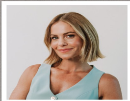
Candace Cameron Bure Actress; Producer; CEO, CandyRock Entertainment