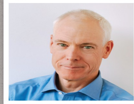
Jim Collins Management Educator; Bestselling Author