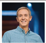
Andy Stanley Founder, North Point Ministries; Bestselling Author