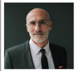
Arthur C. Brooks Harvard Professor; Bestselling Author