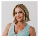
Candace Cameron Bure Actress; Producer; CEO, CandyRock Entertainment