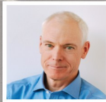
Jim Collins Management Educator; Bestselling Author